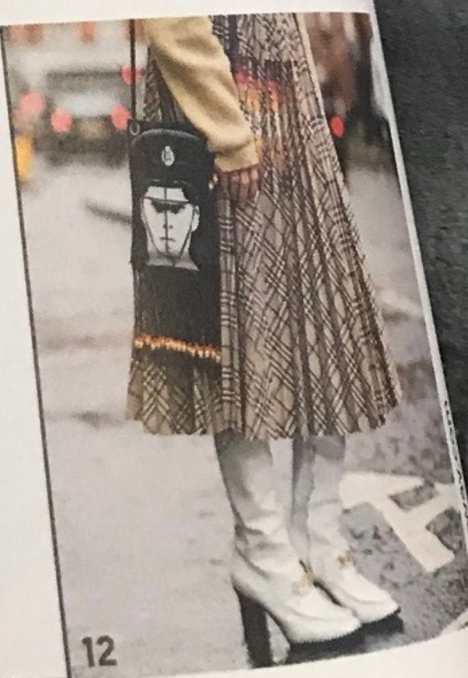
1. Fendi. 2. Elisabetta Franchi. 3. Salvatore Ferragamo. 4. Sergio Rossi. 5. Christian Louboutin. 6. Chopard Eyewear by de Rigo. 7. Giorgio Armani Eyewear. 8. Ripani. 9. Francesca Bassi. 10. Street style in London. 11. Street style in Paris. 12. Street style in London.